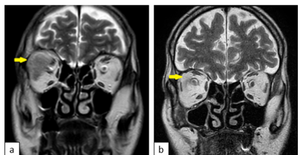
Figure 2. Retro-orbital Metastasis in Patient with Chromophobe Renal Cell Carcinoma (a) Before and (b) After Radiotherapy