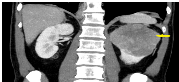
Figure 1. Renal Mass in Patient with Chromophobe Renal Cell Carcinoma

Orbital metastases are an indicator of hematogenous spreading associated with a poor prognosis. Palliative care enhances the patient's quality of life by controlling symptoms. In a meta-analysis conducted in Canada, orbital metastases were detected in 80 patients affected primarily by breast (29%), melanoma (20%), and prostate (13%) cancer. The most frequently reported symptoms were diplopia (48%), followed by pain (42%) and vision loss (30%). The study found that radiotherapy can be very effective at relieving symptoms. 19 Another retrospective study examined 15 patients with orbital metastases. After palliative radiotherapy using 20–30 Gy doses in 10–15 fractions, all patients achieved a complete response in terms of eye pain and proptosis, and 84.6% showed a