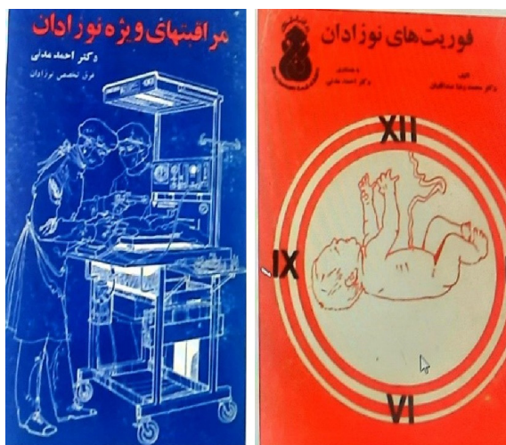
Figure 3. Two Persian Books “Neonatal Emergencies” and “Newborns’ Special Care”, Published by Shiraz University of Medical Sciences