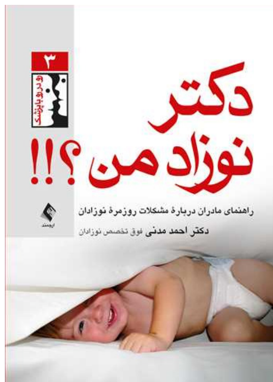
Figure 2. A Persian Guide for Mothers about Everyday Problems of the Babies, Authored by Dr. Madani