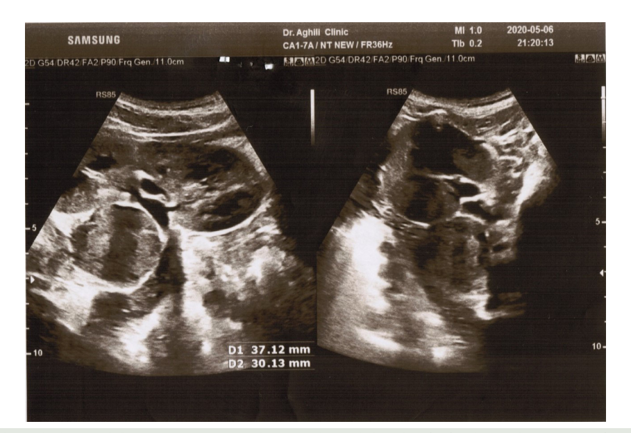
Figure 1. Abdominal Ultrasound Showing a Retroperitoneal Mass on the Medial Border of Left Kidney with a Diameter of 30 mm×37 mm.

Please refer to the Supplementary File 1 (Methods applied in WES test, including sample preparation, sequencing techniques, and data analysis approach for variant detection), and Supplementary File 2. The WES test revealed a frameshift mutation (Chr11:111958680:TGTCACCGA>T, NM_003002.4:exon2:c.154_161del:p.ser52Profster14)