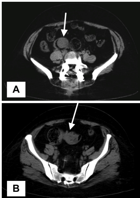
Figure 1. Abdominal Computed Tomography Images. (A) The polypoid lesion with a diameter larger than two cm, protruding from the wall to the lumen in the terminal ileum (white arrow). (B) A nested segment which is compatible with ileo-ileal intussusception (white arrow)

about three cm with a stalk; the length of the stalk was two cm, and the diameter was nearly 1.5 cm (Figure 2B). The invaginated segment was hyperemic and partially edematous. Small bowel anastomosis was performed after segmentary resection involving the intussusception area and the polypoid lesion. The patient was discharged on the sixth postoperative day with full recovery. The specimen's pathology was reported as an inflammatory fibroid polyp.