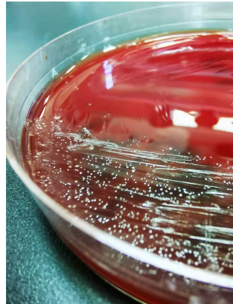
Figure 4. Confirmation of Actinomyces Odontolyticus Infection by Microbiology Culture.