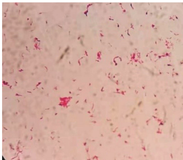
Figure 5. Light Microscope Image of Bacteria ( \times 1000 ).

A 63-year-old patient with left chest pain was admitted to the emergency department for ten days. His clinical symptoms had rapidly progressed to persistent pain, abundant purulent sputum, and severe hypoxemia at the time of admission. He also had a 40-pack-per-year history of smoking with poor oral hygiene. Physical examination revealed that the patient had decreased respiratory sounds in the left hemithorax, with dullness on percussion. Laboratory findings revealed that the patient's white blood cell count was 16.3 \times 10^9/L , and his hypersensitive C-reactive protein (hs-CRP) was 110 mg/dL ( N < 10 ).