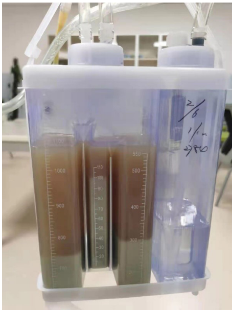
Figure 3. Gross Appearance of Pleural Effusion.