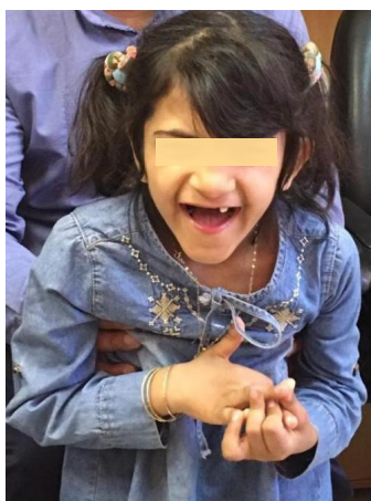
Figure 1. The Facial Features and Curved Fingers of the Patient.

The whole genome oligo Array CGH (Agilent, Santa Clara, CA) was performed using CYTOCHIP ISCA 8X60K version2 (Kariminejad-Najmabadi Pathology and Genetics Center, Iran) and analyzed using Blue Fuse Multi software per manufacturer's protocol. Cytogenetic analysis of the patient revealed 46, XX, der(10)t(4;10)(p12;q26.3) (Figure 2A). G-banding analysis of the mother showed 46 chromosomes with a balanced translocation between the short arm of chromosome 4 and the long arm of chromosome 10. Moreover, her karyotype was 46, XX,t(4;10)(p12;q26.3) (Figure 2B). The father's karyotype was normal. The array CGH results showed that the patient had the following genomic imbalances: (GRCh37) arr4p16.3p12 (37,152-45,490,207) x3, 10q26.3 (134,872,562-135,434,149) x 1. A 4.5 Mb genomic gain at 4p16.3p12 (Figure 2C) and 561.6 Kb terminal deletion at 10q26.3 compatible with trisomy 4p16.3p12 and 561.6 Kb loss of 10q26.3 compatible with monosomy of 10q26.3 were detected.