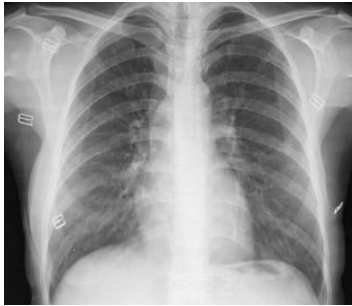
Figure 2. Interstitial Infiltrates in Both Lungs.