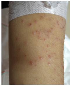
Figure 1. Multiple Vesicles, Pustules and Crusty Skin Lesion.