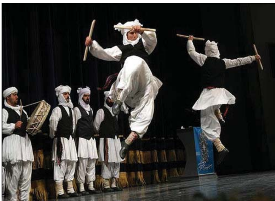
Figure 1. Picture of “ Choobazi ” ceremony in which fighters symbolically fighting each other while others playing music and/or watching the encounter. Choobazi is an existing tradition which ceremonially implement across Iran. 10

The second method portrayed by Eton pertains to his trip to the Turkish Empire where he witnessed another horrible limb fracture; the bonesetter placed the limb in a wooden plaster box and poured molded Plaster of Paris into it. During the process of rigidifying, the bonesetter might place some wooden stick through it and remove them later. The holes which remained could serve as drainage canals. Bandages were also wrapped around the stiffening cast to form it decently and/or make it more lightsome