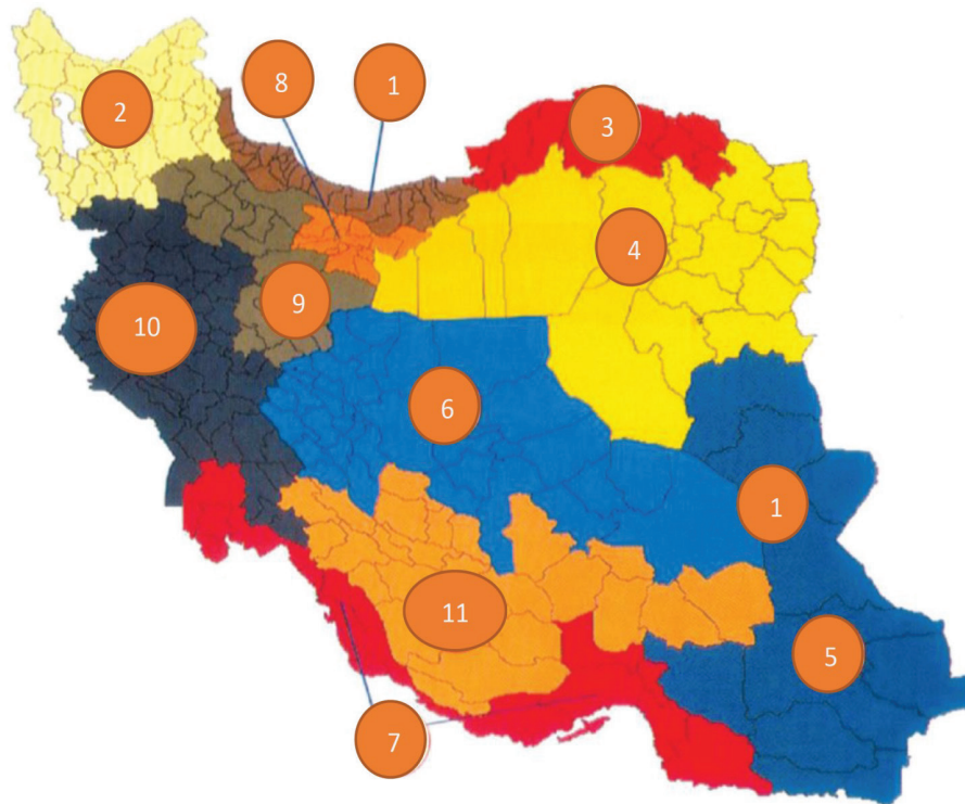
Figure 1. The geographic presentation of the study regions.

used two alternative statistical methods to analyze the data and compared the results of these methods. The findings of the current study can be generalized to the entire population of Iran, given its large and representative sample.