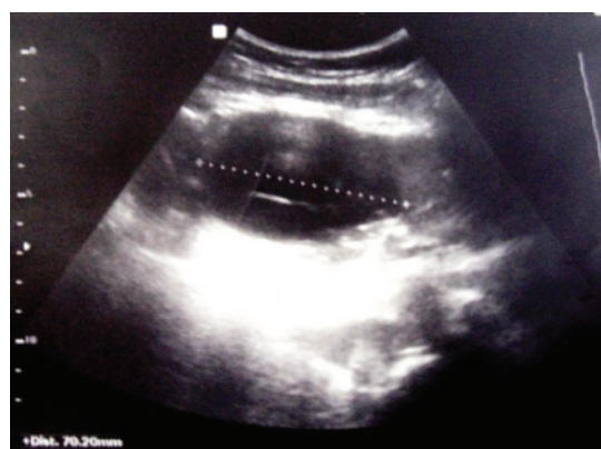
Figure 1. Sonography of the hepatic mass

A 32-year-old woman presented with flank pain. She was found to have a hepatic cyst by sonography in the medial segment of the left hepatic lobe, which measured 70 mm in diameter (Figure 1) and was confirmed by CT scan (Figure 2).