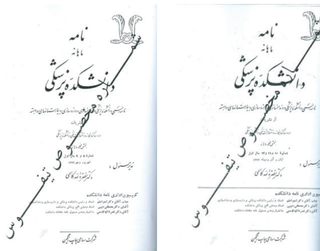
Figure 1. The front covers of two successive issues of the Nameh Mahaneh-ye Daneshkadeh-ye Pezeshki (the Monthly Letter of School of Medicine) affiliated to Tehran University Faculty of Medicine, which were devoted to typhus, 1943.

motahbegheh for typhoid fever to avoid misdiagnosis. 30