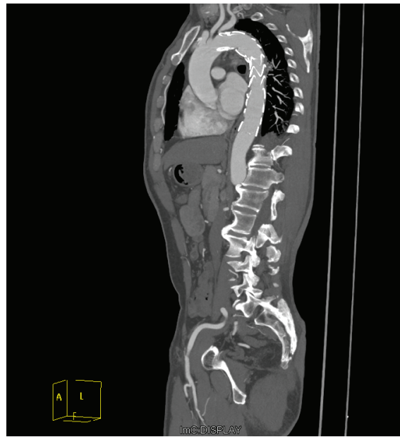
Figure 2. Covered stent (Medtronic TF 3030C200EE) isolates pseudoaneurysm completely. No endoleak occurred.