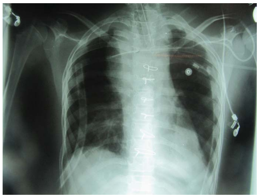
Figure 2. Chest x-ray two days after transplantation shows infiltration in the left lower lobe, mild cardiomegaly, and mediastinal widening with right- sided aortic arch.

post-transplantation hours. In total, seven units of compatible packed red blood cells, 18 of platelets, four of whole blood, and eight of fresh frozen plasma were transfused throughout. Inotropic support was discontinued gradually by the second postoperative day (Figure 2). The patient was extubated on the postoperative day 4 after hemodynamics were stable and satisfactory gas exchange was present.