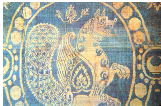
Figure 7. Sassanid silk robe depicting Simurgh (senmurw), 6 th – 7 th century CE