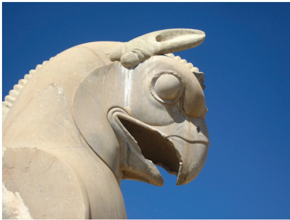
Figure 5. Column head of Homay from Persepolis, the Achaemenids Palace in southern Iran, around 2500 years ago

It thus seems reasonable to assume with some confidence that the Méréghô Saêna or Sênmurw of the Avesta was in fact the Golden Eagle.