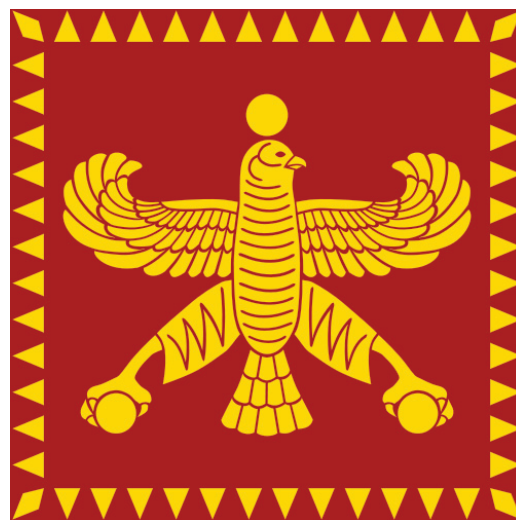
Figure 4. The falcon (Shahin), the Standard of Cyrus the Great, the first Achaemenids King

And so it seems that the Falcon (Shahin) cannot be the bird Saêna although it featured on the royal standard of Cyrus the Great and those of other Achaemenid Kings (figure 4).