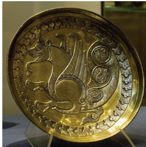
Figure 6. Sassanid silver plate of a simurgh (senmurw), 7 th – 8 th C.E.

Some late Sassanian pictorial iconography on silver platters, silk robes or coins which depict some mythical bird with the head of a dog, the claws of a lion or a raptor and the tail of a peacock or a rooster have been interpreted as depictions of Sênmurw due to the descriptions of the bird given in Bundahishn. Bundahishn, meaning 'Primal Creation', is a Zoroastrian text, written in the Pahlavi language (middle Persian) concerning cosmology and cosmogony. Most of this book was compiled in the 8 th and 9 th centuries C.E. and some parts are even younger. In some chapters on the classification of animals, the Sênmurw is classified as a bird yet in other chapters as a bat or a dog. This confusion of the nature of Sênmurw is most probably responsible for the iconographic representation of Sênmurw with the head of a dog, the claws of a raptor and the tail of a peacock or a rooster as well as to the stories describing it as female breastfeeding its young, similar to a bat. This confusion would explain the hybrid creature depicted in late Sassanian illustrations of the Sênmurw (Figures 6 and 7).