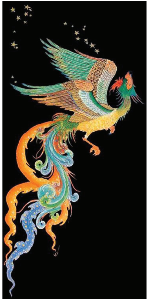
Figure 9. A modern depiction of Simurgh

I have briefly reviewed the myth of the bird Simurgh in its main three phases in Iranian history and its relation to medicine. His dispersal of the