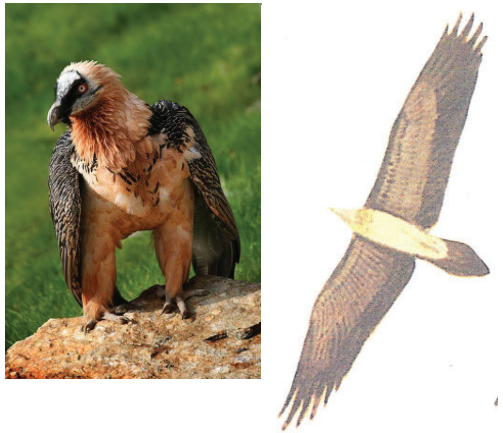
Figure 1: a) Bearded Vulture; b) Wing span 4

1. The vultures are the largest of these families with the Bearded Vulture, Gypatus barbatus (Farsi=Homay) reaching a size of 100 to 110 cm (from head to tail), with a wing span of 3 meters and lives on very high and isolated mountains (Figure 1).