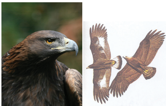
Figure 2. a) the golden eagle; b) wing span 5

2. The Golden or Royal eagle, Aquila chrysaetos , (Farsi=Oghabe Talai) is one of the largest eagles with a size of 75 to 83 cm (from head to tail) and a wing span of 2 meters or more. They are powerful birds of prey and very swift in flight, and can dive at speeds of up to 240 kilometers per hour upon their quarry. They build their nests on high mountains, or on rocky cliffs near the sea or sometimes on a tree. Their nests are large, up to 2 meters in diameter and one meter in height, made of large tree branches, and when made on a tree, the supporting branches may break due to the weight of the nest (Figure 2). 5