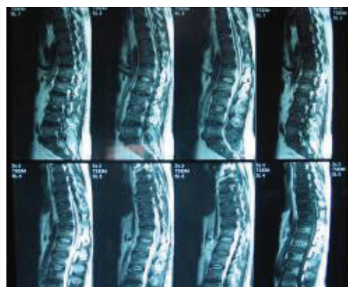
Figure 2. Thoracolumbosacral MRI of the patient