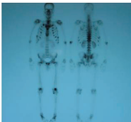
Figure 1. Bone scan of a 54-year-old man