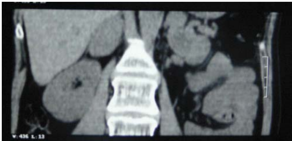
Figure 1. Adrenal CT imaging of the patient