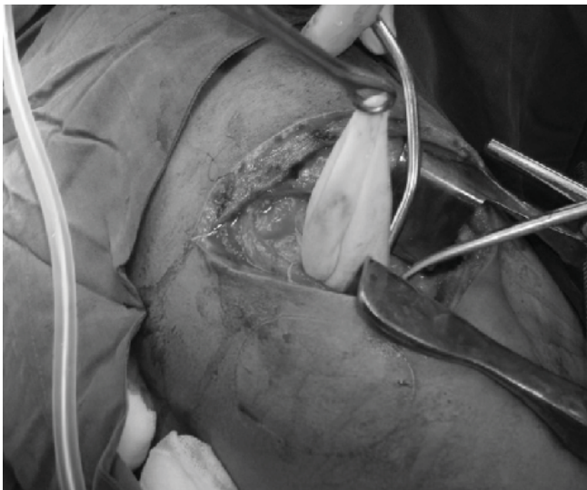
Figure 2. Operative view (resection of the laminating membrane of hydatid cyst of the posterior mediastinum)