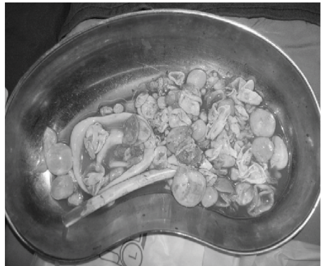
Figure 3. daughter cysts and laminating membrane postoperative

duce the risk of perforation and dissemination. 2,7 In our case, the cyst was ruptured during exploration. When there is a risk of dissemination, oral albendazole or mebendazole for 3–6 months can be prescribed (with assessment of hepatic function before initiating treatment). 2