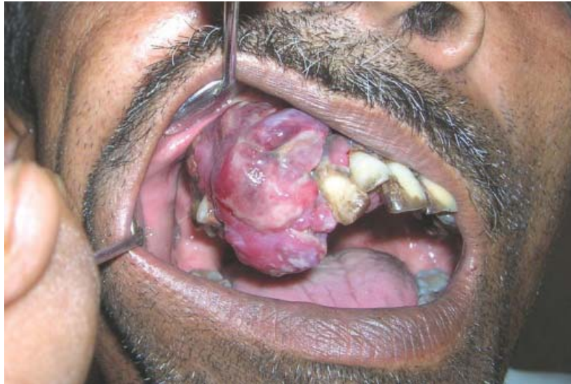
Figure 1. Clinical photograph shows an exophytic ulceroproliferative growth in the right maxillary alveolar ridge.