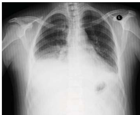
Figure 1. Pleural effusion in posteroanterior (PA) chest X-ray.