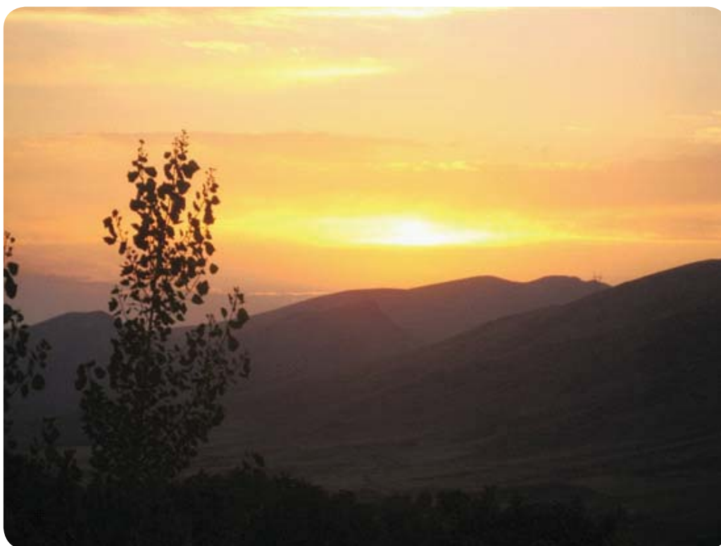
A sunrise view in Taleqan - Alborz Province - Iran.