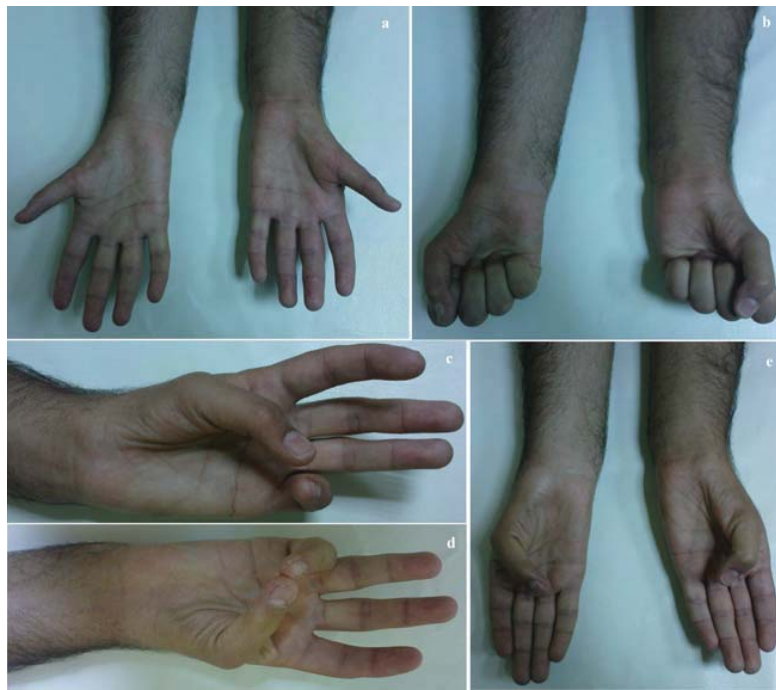
Figure 1. a) Atrophy in both thumbs and bilateral flattening of the thenar eminences, b) Atrophy in both thumbs and bilateral flattening of the thenar eminences c) Opposition deficit in the left hand, d) Opposition in the right hand, e) Abduction deficit in both thumbs.