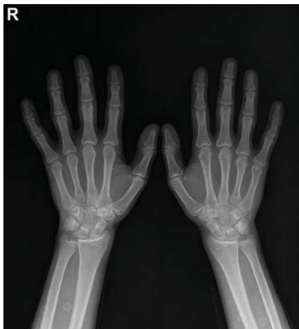
Figure 2. X-ray (AP) graphies of both of the wrists.