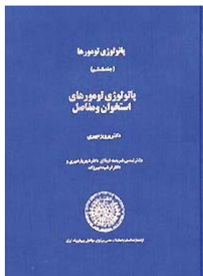
Figure 3. "Pathology of Tumors of the Bones and Joints" written by Professor Dabiri.

Pathology of Tumors (40 volumes), of which 6 volumes including pathology of tumors of the lungs, prostate, bladder, thyroid, kidneys, bones and joints have been published (Figure 3). Congenital Disorders of the Heart, 1958 (Figure 4). A Practical Guide of Pathology for Medical Students.