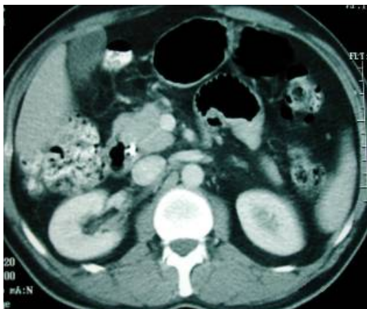
Figure 1. Spiral computed tomography (CT) scan showing a shrapnel splinter (right arrow) in the periampullary area near the head of the pancreas

of the liver, right kidney, subcutaneous tissue, and one in the periampullary area near the head of the pancreas (Figure 1). The latter one was presumed to be the probable cause of the patient's symptoms, thus the patient underwent a diagnostic endoscopic retrograde cholangiopancreatography (ERCP). There was a narrow segment dilatation in the common bile duct (CBD) and a filling defect in the CBD portion, which suggested a foreign body with a size of 5×7 mm (Figure 2). Subsequently, a sphincterotomy was performed and the foreign body, which was similar to shrapnel splinter, was pulled from the duct with a basket (Figures 3 and 4). The patient was assessed in the outpatient clinic two weeks later and found to be in good condition without evidence of jaundice or abdominal pain. Laboratory tests were within normal limits.