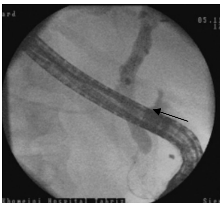
Figure 2. Endoscopic retrograde cholangiopancreatography imaging window showing a foreign body (black arrow) in the CBD before sphincterotomy

Foreign bodies in the biliary tree are rare causes