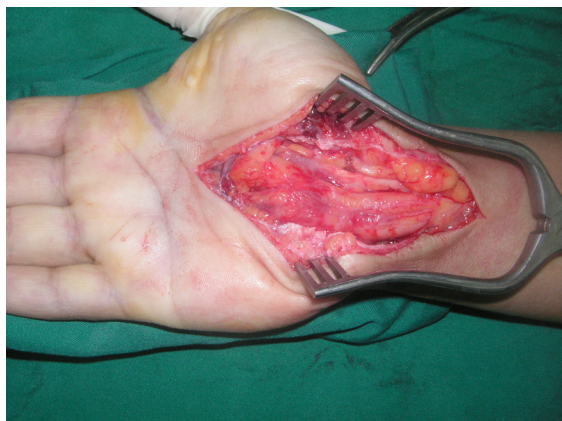
Figure 1. The intra-operative view of the lipofibromatous hamartoma of the right hand's median nerve of the patient

fibroses between the nerve fascicles. Excision of the fatty tissue between the nerve fascicles was impossible without the risk of incurring damage to them. Therefore, the tumor was left intact, and the operation was limited to a transverse carpal ligament release and epineurotomy. A small piece of the tissue was removed for histological examination; which showed fibrofatty elements of a tumor with an indefinite lobular pattern separating the nerve fascicles and fibers (Figure 2). Six months after surgery, the patient had marked improvement in her symptoms and there was no increase in tumor size. The term lipofibromatous hamartoma best describes the nature of this tumor.