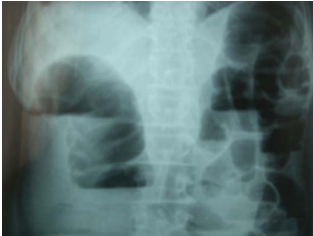
Figure 1. Plain abdominal X-rays were first obtained in patient with acute symptoms, which revealed air-fluid levels suggestive of intestinal obstruction.