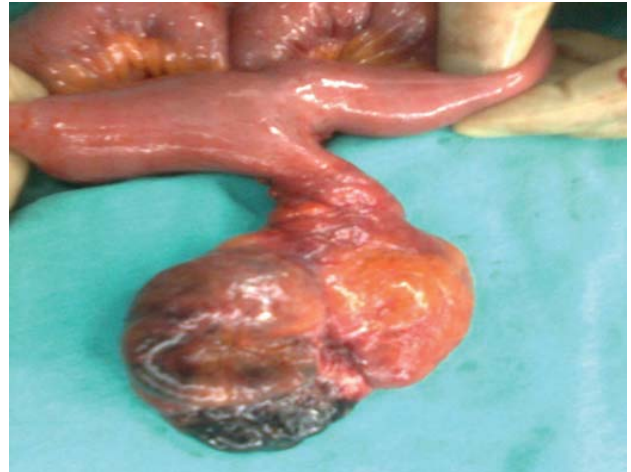
Figure 2. A 25 mm nodule was found at the apex of Meckel's diverticulum.