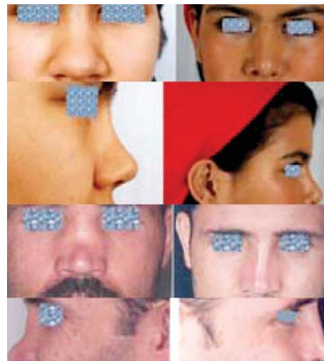
Figure 2. Pre- and postoperative views of two patients.

Figure 2 shows the preoperative pictures and postoperative results of 2 patients.