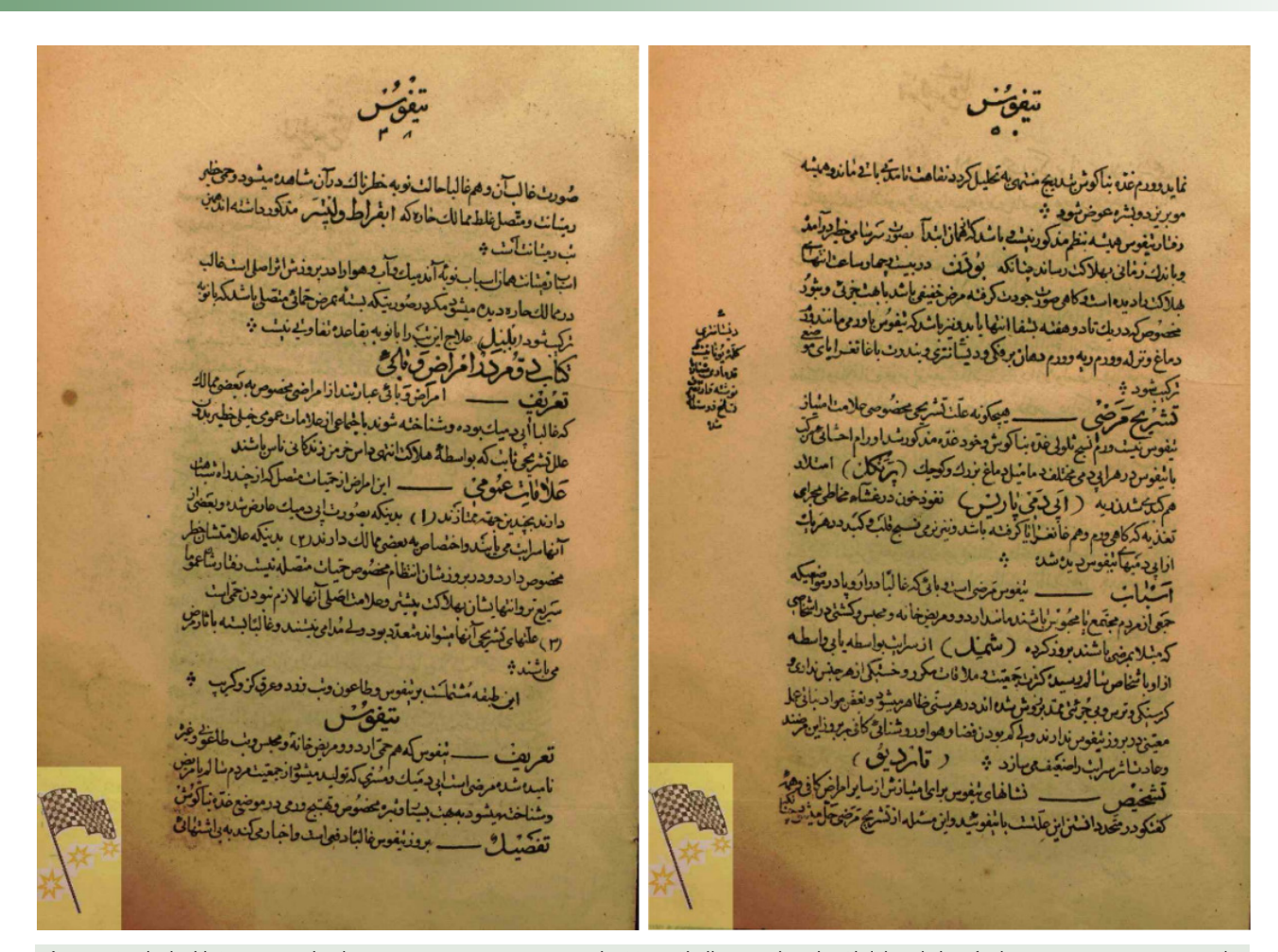
Figure 2. Matlaol-tebb Nasseri is a book in 581 pages in Persian written by Mirza Abolhassan Khan Ibn Abdul Wahab Tafreshi (1845–1902), It mentions the treatment of each disease and contains details about typhus.<sup>7,34</sup>