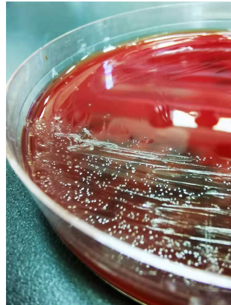
Figure 4. Confirmation of Actinomyces Odontolyticus Infection by Microbiology Culture.