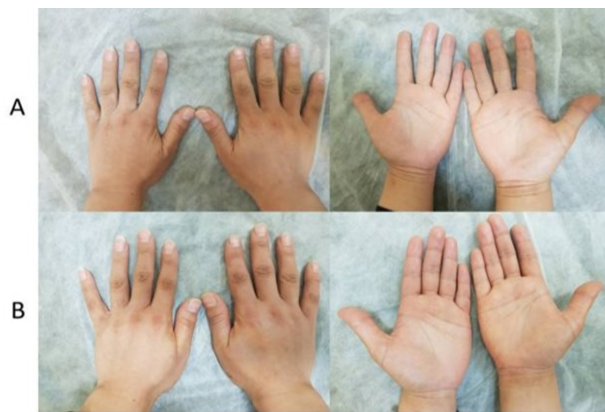
Figure 2. Image of Hands (A) before Treatment, (B) after 10 Days Treatment by Topical Atorvastatin and Betamethasone.

HECSI score (as dependent variable) between the atorvastatin group and the placebo group after controlling for pre-intervention HECSI score (as covariate) ( F(1, 84) = 378.873 , adjusted mean difference [AMD] = 5.756; 95 % confidence interval for difference: 5.168 to 6.344, P < 0.001 ).