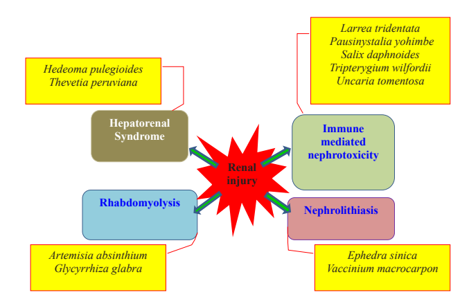
Figure 2. Types of Nephrotoxicity in Herbal Drugs.

the causes were associated with neurotoxin intoxication. In fact, the poisonous substances do not affect the respiratory system alone, but act simultaneously on other important parts of the human organism.