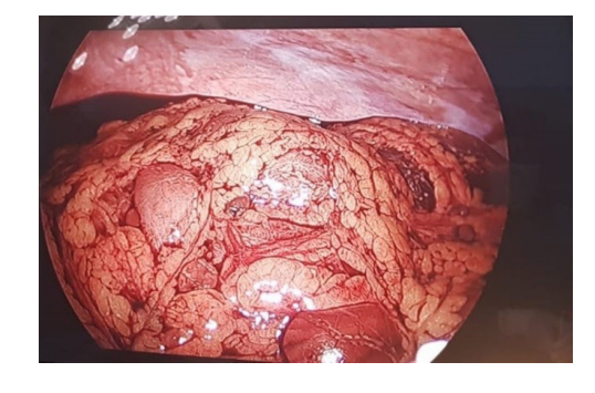
Figure 2. Diagnostic Laparoscopy. Hematoma in the intestinal wall and hemoperitoneum are seen.

Recently, the incidence of IHSB seems to be increasing. The probable cause of this situation is assumed to be widespread use of advanced diagnostic methods such as CT and increased use of OAC therapy. The incidence is comparatively higher in males and in patients aged 69 to