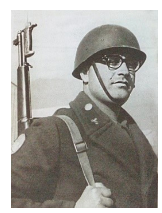
Figure 2. Dr. Hossein Malekafzali as the Health Crops Force in Pasdaran Garrison, 1965.

of Public Health for 6 months in 1984 at the suggestion of the previous head of university of Tehran, and then served as the deputy of health and sub-governor of the minister at headquarters of the health network expansion for nine years from 1984 to 1991 and from 1993 to 1995 in Iran.