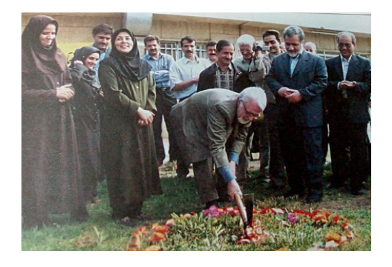
Figure 4. Groundbreaking Ceremony of the Cardiovascular Research Center as the Research Deputy of the Health Ministry, Isfahan University of Medical Sciences, 2001.

He still pursues the public empowerment programs to identify and prioritize existing problems and plans to solve them by utilizing local, provincial and national capacities. In this regard, their comprehensive health center of Eskan neighborhood has covered a population of more than 16,000 people from the western margin of Yazd by the Optimal Development Plan for Neighborhood Health (ODPNH) since 2016.