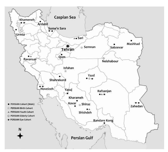
Figure 2. PERSIAN Cohort Sites Throughout Iran. The Cohort sites have been chosen to include all the major ethnicities and geographical areas within Iran to capture different exposures.